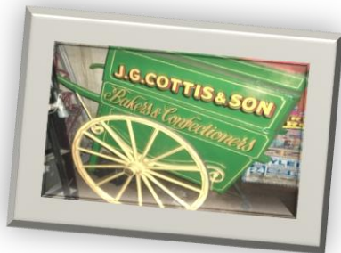
Cottis and Son Bakers cart