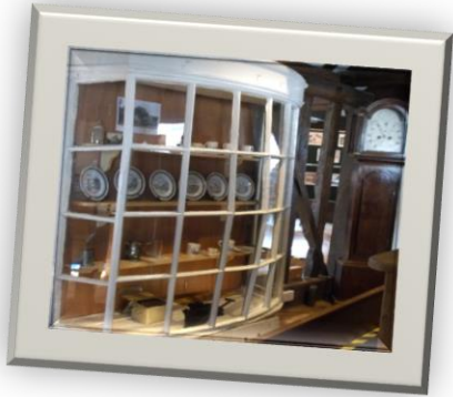
Inside the Museum