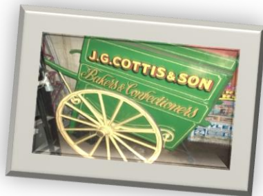
J G Cottis & Son Bakers cart