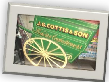
Cottis and son Bakers cart